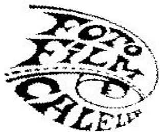
Foto Guanyadora d'entrega